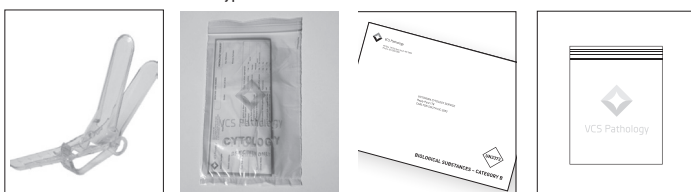
(f) Specula (g) Specimen Bio Hazard Bags (h) Reply Paid Satchel (post only) (i) Zip Lock Bags with liner